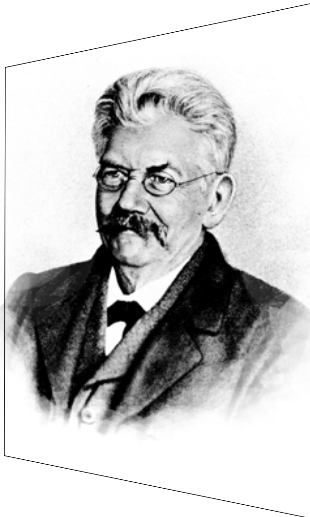
Friedrich Wilhelm Radloff (1837—1918)