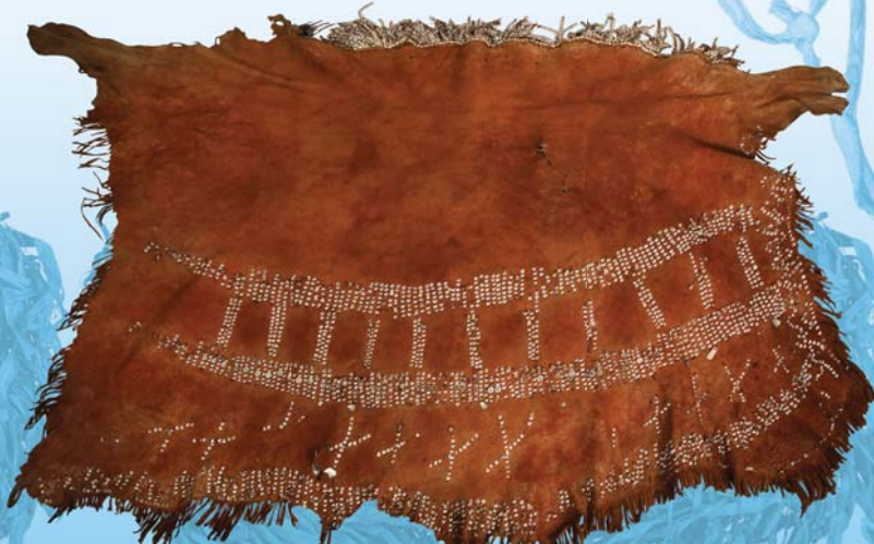
▲ Suede cloak

Members of the other secret society – Corn Faces - made masks depicting the spirit of corn.