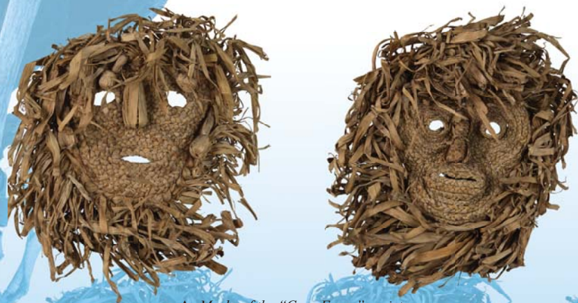
▲ Masks of the "Corn Faces" society