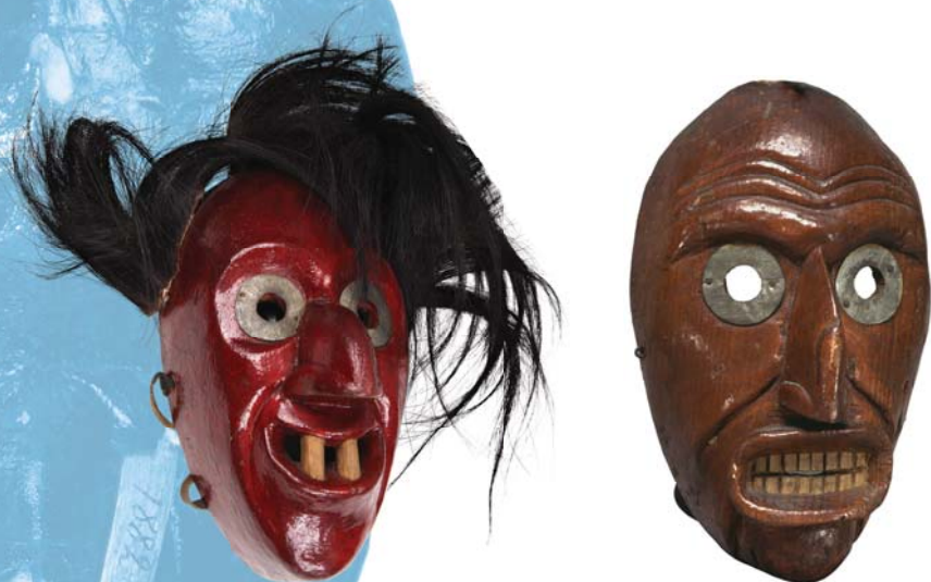
▲ Masks of the "False Faces" society

Ceremonies of these secret societies were accompanied by singing and dancing and the sound of drums, and rattles made of tortoise shells.