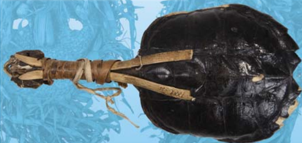
▲ Rattle made of tortoise shell