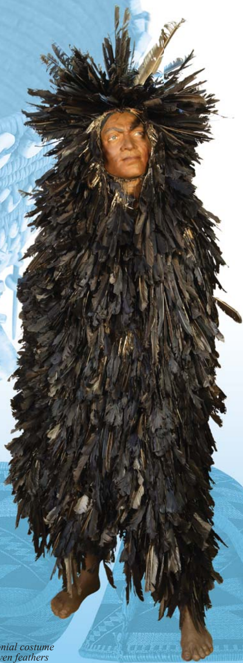
▲ Ceremonial costume made of raven feathers

Such costumes were worn by the chiefs and shamans during the most important religious ceremonies dedicated to the local cults.