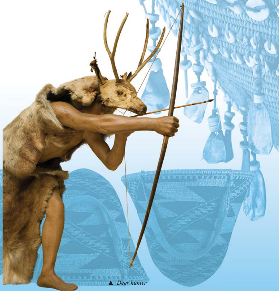
▲ Deer hunter

Men were occupied with hunting. When hunting deer, the hunters disguised themselves. They put on deer skins and, imitating the animals' goings-on, waited for them at a watering place. The deer have good sense of smell but poor eyesight, and it allowed a hunter approach the herd from the lee side and shoot arrows from a short distance.