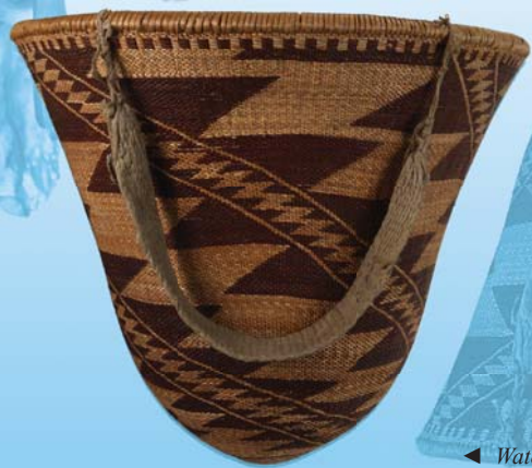
◀ Waterproof basket