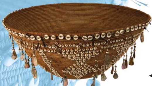
◀ Basket ▼

Large baskets were used to keep and transport goods and for making food. They were woven so tight that they were waterproof. Baskets were filled with water that was boiled in them with the help of red-hot stones and then meat or fish was cooked in it. Californian Indians did not know pottery.