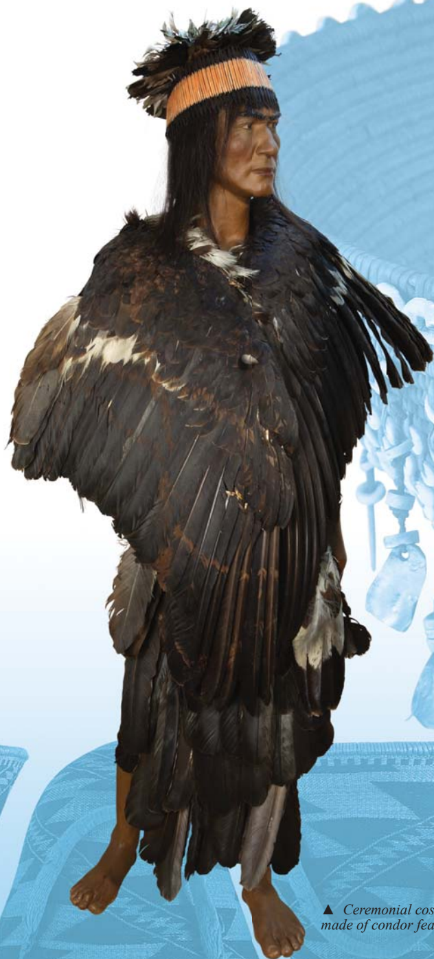
▲ Ceremonial costume made of condor feathers

Californian Indians' ritual clothes refer to the Museum's unique exhibits. These are costumes made of condor and raven feathers.